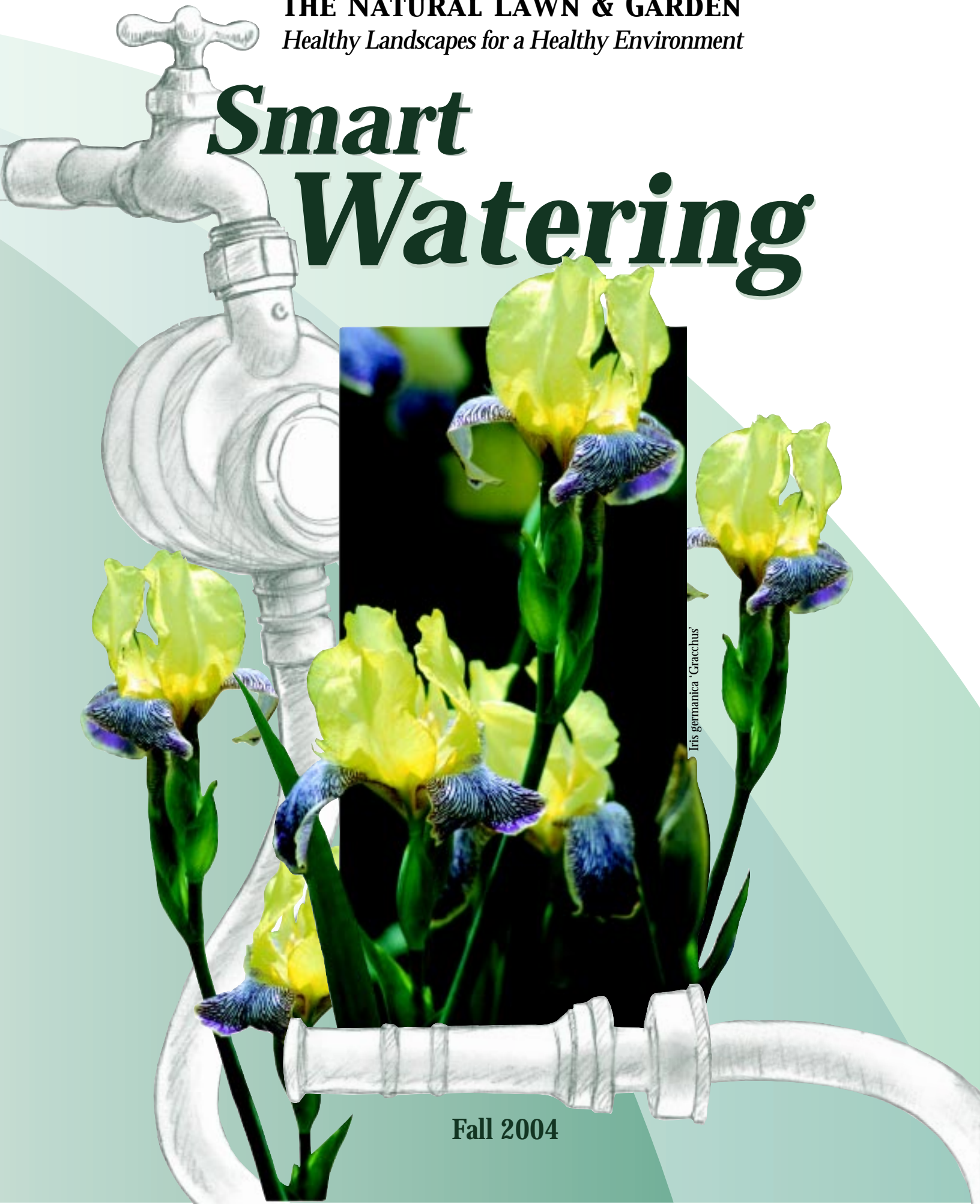
Iris germanica 'Gracchus'