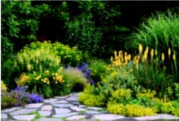
Waterwise Garden at the Bellevue Botanical Garden