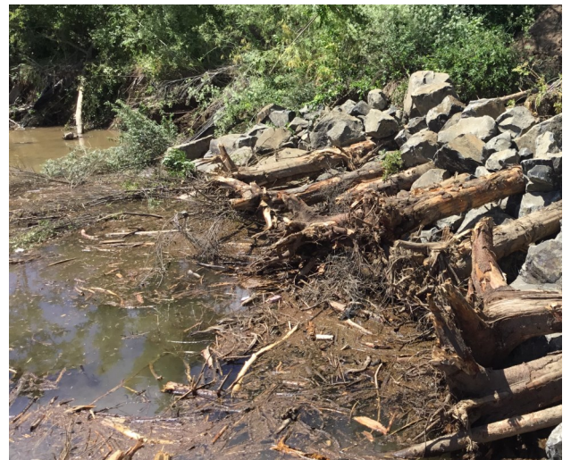
Bank Erosion project on Mill Creek